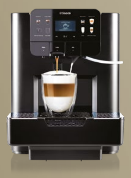
AREA OTC HSC Lavazza Blue®*