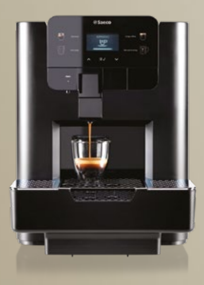
AREA Focus Lavazza Blue®*

Optional water supply connection (with the water supply kit)