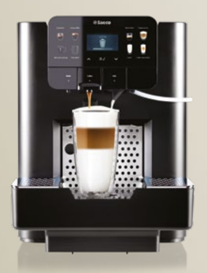
AREA OTC HSC Nespresso®*

Optional water supply connection (with the water supply kit)