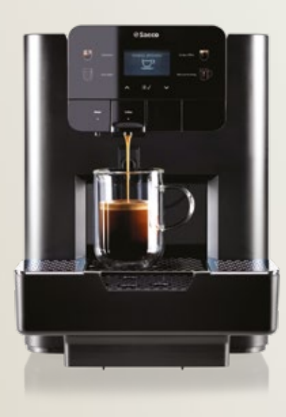
AREA Focus Nespresso®*

Optional water supply connection (with the water supply kit)